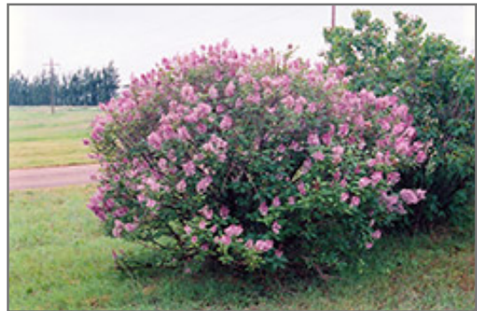
Miss Canada Lilac in bloom