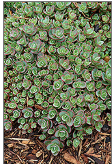
Lime Zinger Sedum