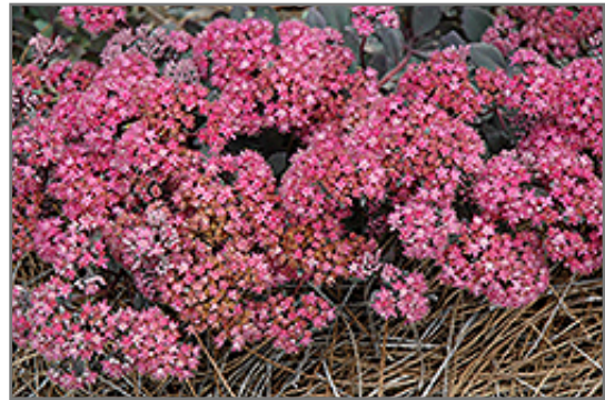
Dazzleberry Sedum flowers

Dazzleberry Sedum is a dense herbaceous perennial with an upright spreading habit of growth. Its medium texture blends into the garden, but can always be balanced by a couple of finer or coarser plants for an effective composition.