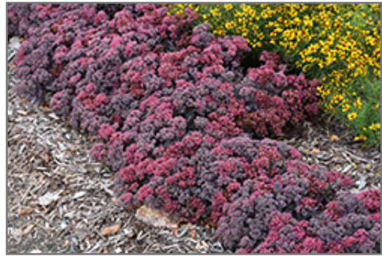
Dazzleberry Sedum in bloom