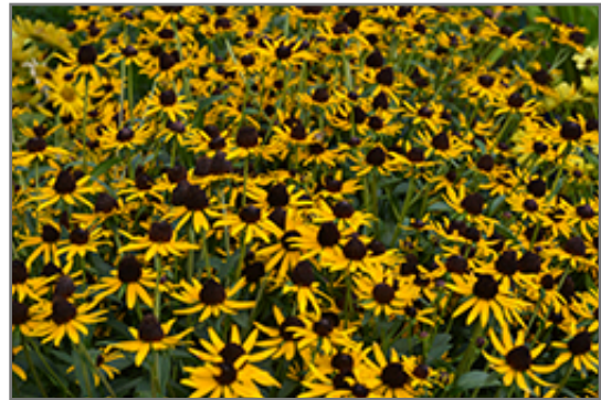
Little Goldstar Black-Eyed Susan flowers