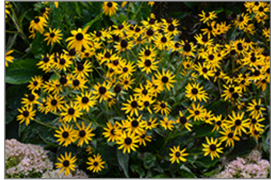
Little Goldstar Black-Eyed Susan in bloom

Little Goldstar Black-Eyed Susan is recommended for the following landscape applications;