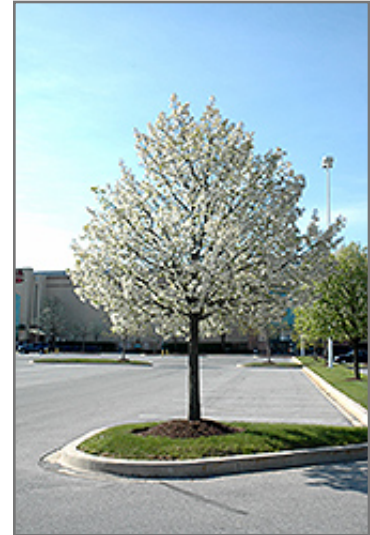
Jack Ornamental Pear in bloom