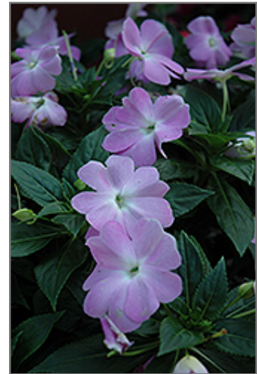
Celebration Icy Blue New Guinea Impatiens flowers