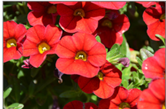
Superbells Red Calibrachoa flowers