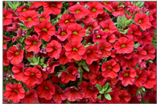
Superbells Red Calibrachoa flowers

Superbells Red Calibrachoa is recommended for the following landscape applications;