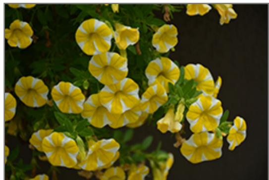
Superbells Lemon Slice Calibrachoa flowers