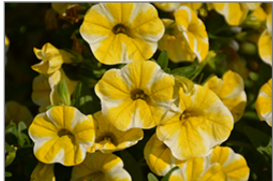
Superbells Lemon Slice Calibrachoa flowers

Superbells Lemon Slice Calibrachoa is recommended for the following landscape applications;