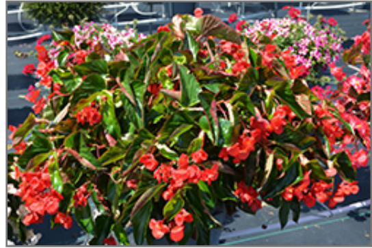
Dragon Wing Red Begonia in bloom