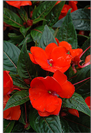
Celebration Orange New Guinea Impatiens flowers