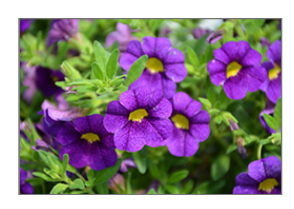
Superbells Blue Calibrachoa flowers

Superbells Blue Calibrachoa is recommended for the following landscape applications;