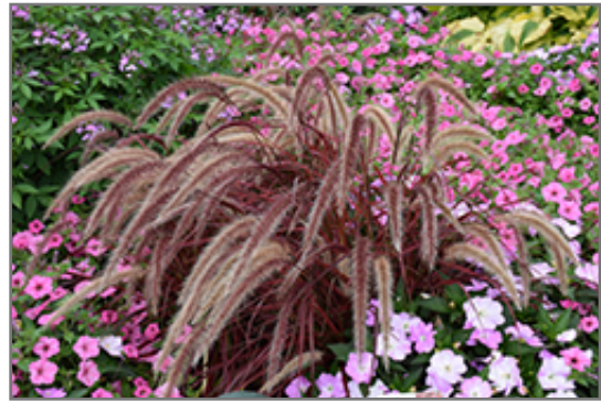
Fireworks Fountain Grass

Fireworks Fountain Grass is recommended for the following landscape applications;