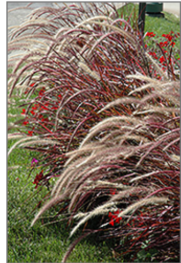
Fireworks Fountain Grass

* This is a 'special order' plant - contact store for details