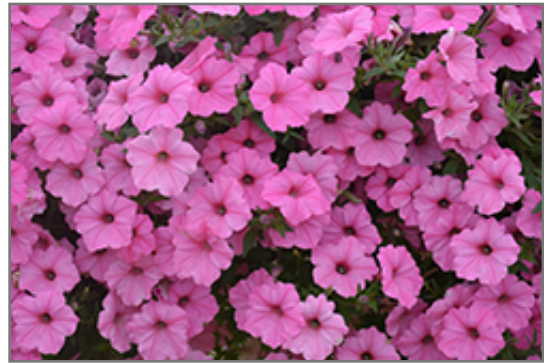
Supertunia Vista Bubblegum Petunia flowers