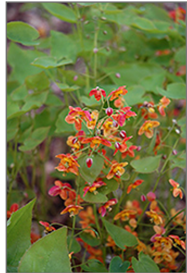
Warleyplace Barrenwort (Bishop's Hat) flowers

Warleyplace Barrenwort (Bishop's Hat) is recommended for the following landscape applications;