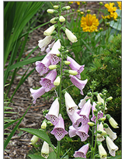
Foxy Foxglove flowers