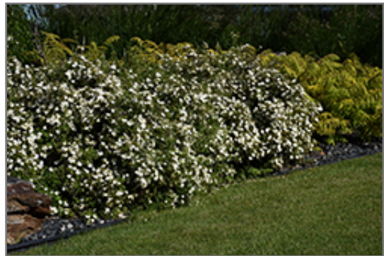
McKay's White Potentilla in bloom