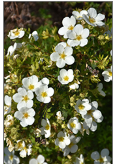
McKay's White Potentilla flowers