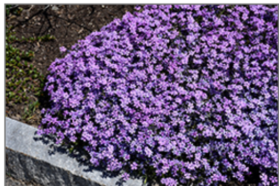
Purple Beauty Creeping Phlox in bloom