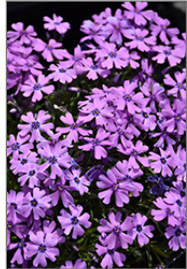
Purple Beauty Creeping Phlox flowers