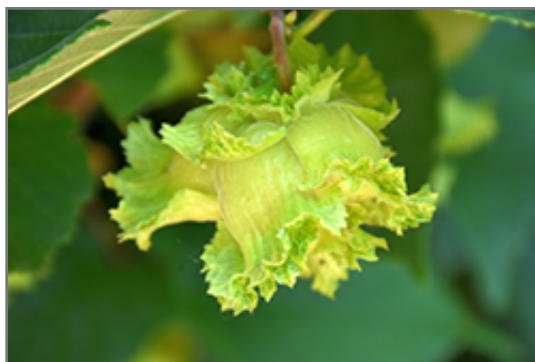
American Hazelnut fruit