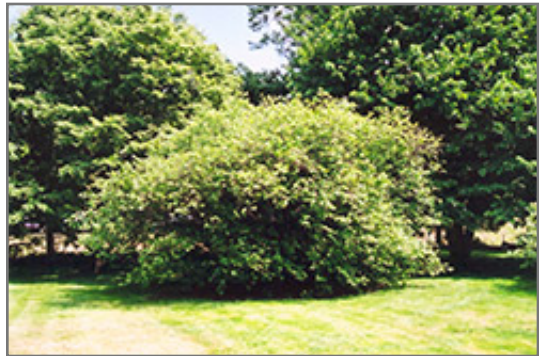
American Hazelnut

American Hazelnut will grow to be about 16 feet tall at maturity, with a spread of 13 feet. It tends to be a little leggy, with a typical clearance of 2 feet from the ground, and is suitable for planting under power lines. It grows at a medium rate, and under ideal conditions can be expected to live for approximately 30 years. While it is considered to be somewhat self-pollinating, it tends to set heavier quantities of fruit with a different variety of the same species growing nearby.