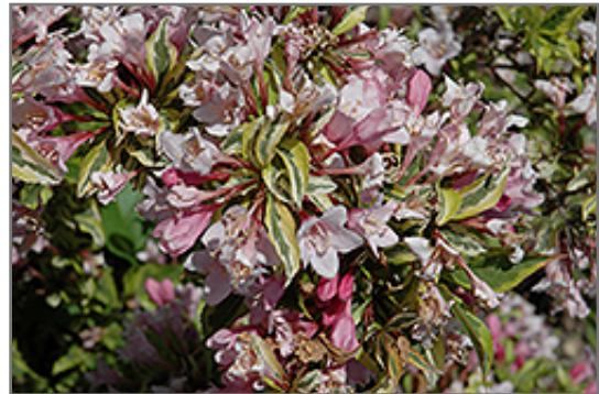
Rainbow Sensation Weigela flowers

Rainbow Sensation Weigela is recommended for the following landscape applications;