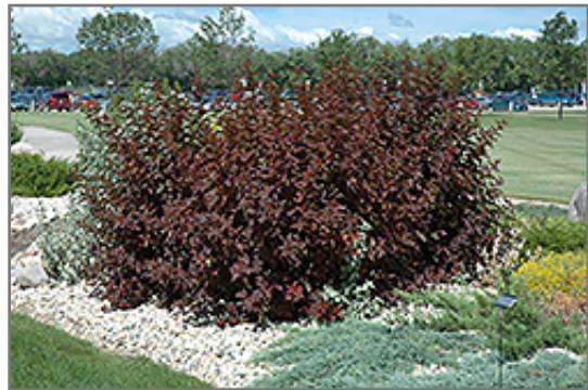
Diablo Ninebark