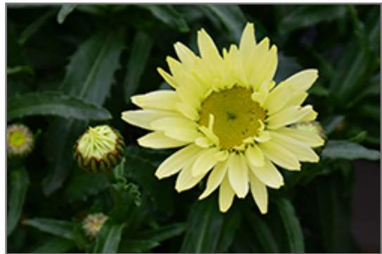
Banana Cream Shasta Daisy flowers