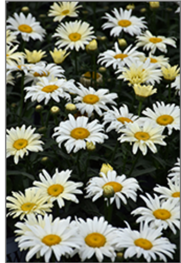
Banana Cream Shasta Daisy flowers

Banana Cream Shasta Daisy is recommended for the following landscape applications;