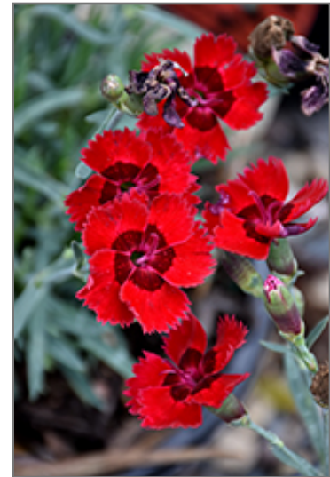
Fire Star Dianthus flowers

Fire Star Dianthus is recommended for the following landscape applications;