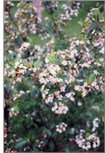
Black Chokeberry flowers

This shrub should only be grown in full sunlight. It is an amazingly adaptable plant, tolerating both dry conditions and even some standing water. It is not particular as to soil type or pH, and is able to handle environmental salt. It is somewhat tolerant of urban pollution. This species is native to parts of North America.