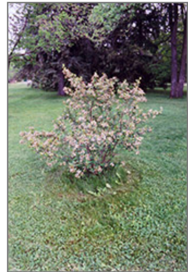
Black Chokeberry in bloom